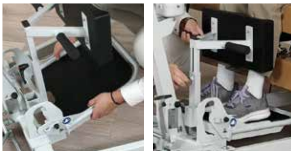
Individually adjustable for both the footboard and shin support