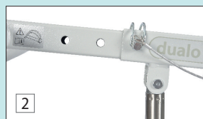
2 dualo® active with active smart lifting arm