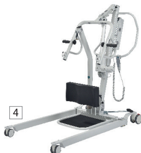
4 dualo® XL with a conversion kit, active and standard plugged together for storage