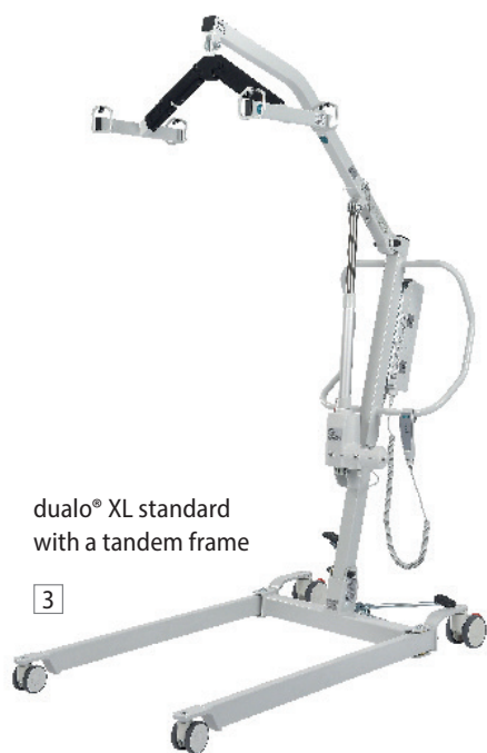
3 dualo® XL standard with a tandem frame