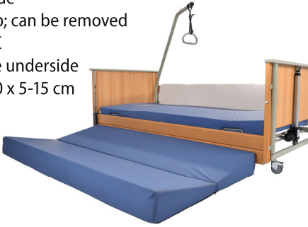
purzel and aks-D4 low entry