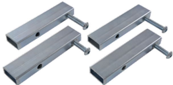
Plug-in feet set to increase stability for aks B4 compact. To be used if the bed frame cannot be attached to the bed frame or if it is too light. Order number – 39652