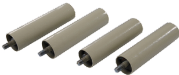
Elevation set 14 cm for better placement underneath with a mobile patient hoist Order number aks B4 compact – 79939