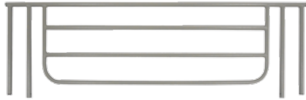
Side bar height extender Order number pebble grey aks B4 compact – 39278 light grey aks B4, XL, XXL – 39279