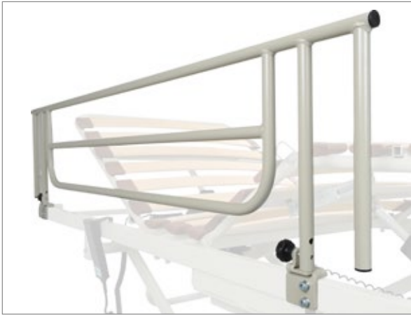
Side grille with special holder Order number pebble grey aks B4 compact – 39239 light grey aks B4, XL, XXL – 39249