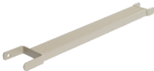
Assembly tool Order number aks B4 compact and aks S4 – 39039