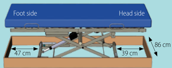
Bed frame, inside: 200 cm